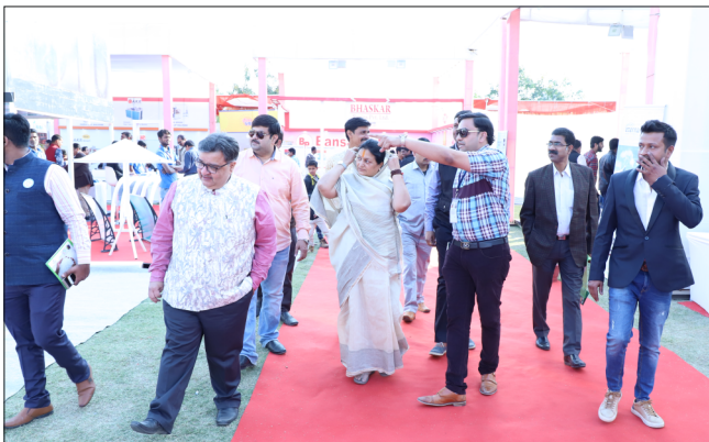
PARTICIPATION IN INDUSTRIAL ENGINEERING EXPO-2018