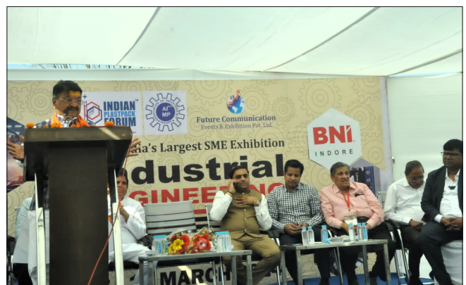
PARTICIPATION IN INDUSTRIAL ENGINEERING EXPO- MARCH 2024

For Any Inquiries & Details Please Contact Us