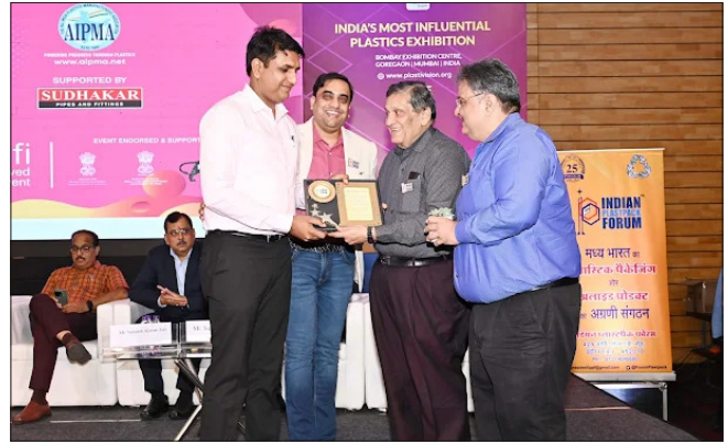
IPPF PARTICIPATING IN PLASTVISION ROADSHOW IN INDORE