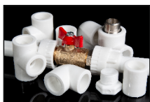
Pipes & Fittings