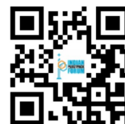
Scan QR For Website