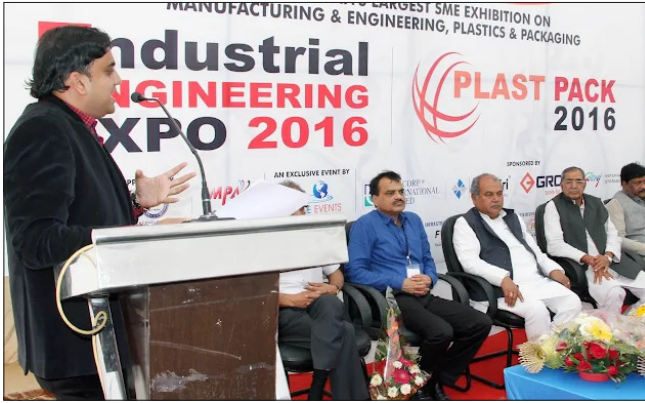
PLASTPACK EXHIBITION IN 2016