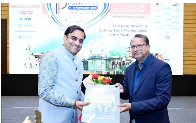
IPPF PARTICIPATION IN PLASTFOCUS ROADSHOW IN INDORE-2022