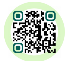
Scan QR For Whatsapp