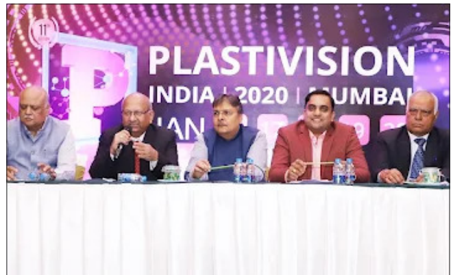
ASSOCIATION WITH PLASTVISION-2020