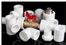
Pipes & Fittings