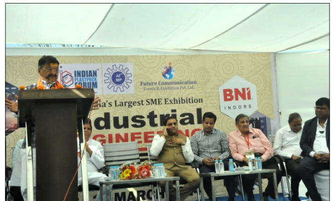
PARTICIPATION IN INDUSTRIAL ENGINEERING EXPO- MARCH 2024

For Any Inquiries & Details Please Contact Us