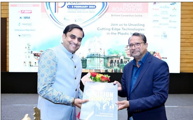
IPPF PARTICIPATION IN PLASTFOCUS ROADSHOW IN INDORE-2022