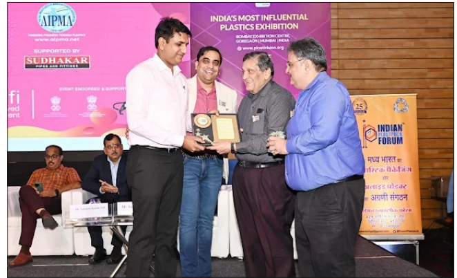
IPPF PARTICIPATING IN PLASTVISION ROADSHOW IN INDORE