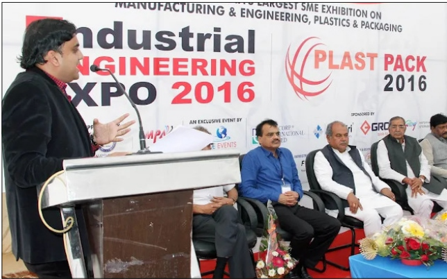
PLASTPACK EXHIBITION IN 2016