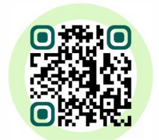
Scan QR For Whatsapp