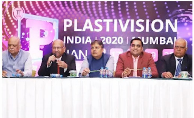
ASSOCIATION WITH PLASTVISION-2020