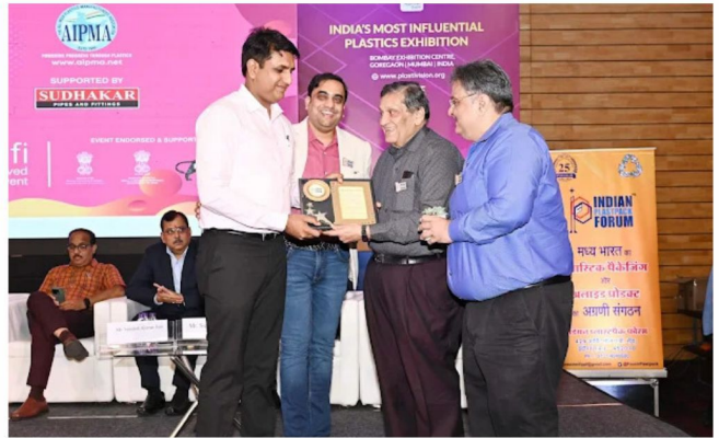
IPPF PARTICIPATING IN PLASTVISION ROADSHOW IN INDORE