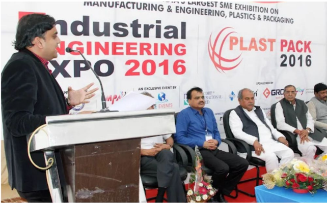
PLASTPACK EXHIBITION IN 2016