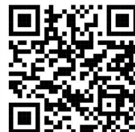
Scan QR For Website