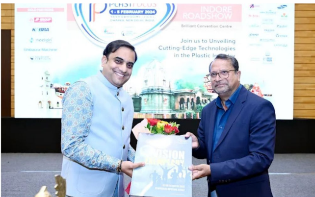
IPPF PARTICIPATION IN PLASTFOCUS ROADSHOW IN INDORE-2022