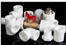
Pipes & Fittings