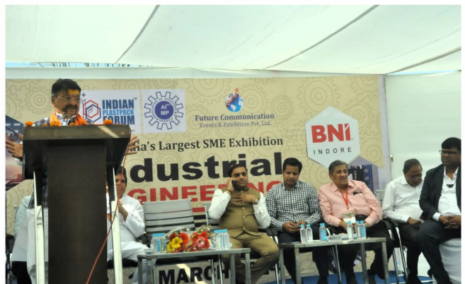
PARTICIPATION IN INDUSTRIAL ENGINEERING EXPO- MARCH 2024

For Any Inquiries & Details Please Contact Us