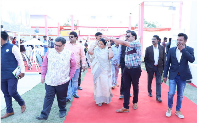
PARTICIPATION IN INDUSTRIAL ENGINEERING EXPO-2018