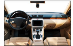
Auto Components Interiors & Under The Bonnet